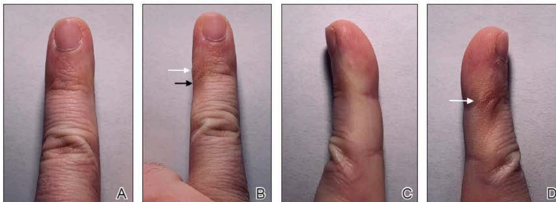
FIGURE 1. Changes to the fifth digit, likely due to extended smartphone use. This patient is right-handed and holds a smartphone with the right hand. A, Dorsal aspect of the left fifth digit. B, Dorsal aspect of the right fifth digit. C, Lateral aspect of the left fifth digit. D, Lateral aspect of the right fifth digit. Black arrow shows indentation of the skin. White arrows show scaly lichenified papule with overlying hyperpigmentation.